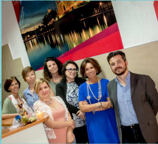
Administrative Staff(University of Messina)

"For thos like me, who started from a A1 level, the Spanish learning was a unique and exciting experience thanks to the harmony in the group of learners and the high-level preparation of the teachers.."